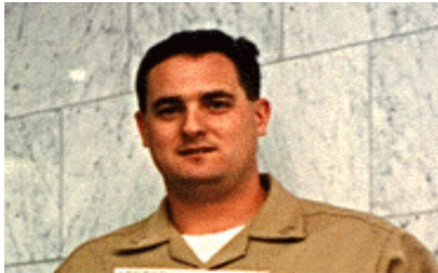
GF Program Manager

Establish Requirements in Gas Free Instruction